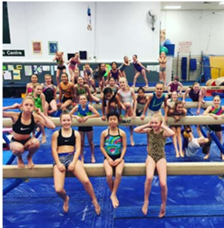
Getting into the Jungle spirit!