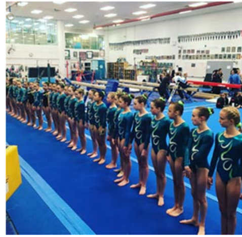
Control Test line up